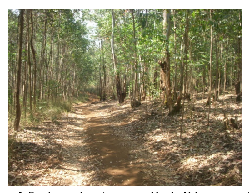
Figure 2: Eucalyptus plantation managed by the Yelwa community

In addition, Biodiversity offset projects, in which industries help financing biodiversity conservation projects as a way of paying for industrial wastes they release into the environment is very limited in Nigeria. Only very few industries are funding biodiversity projects.