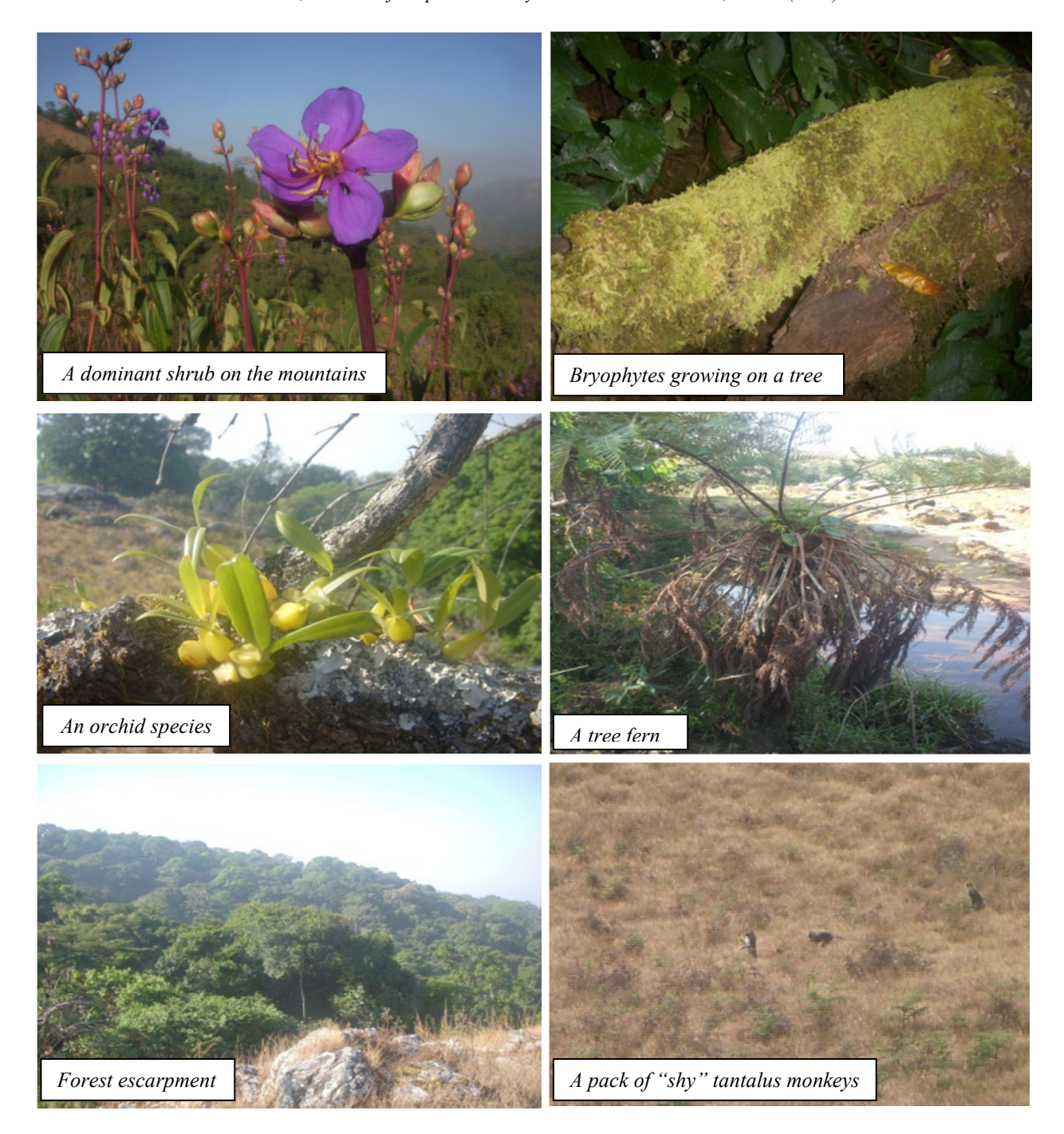
Plate 2: Photographs illustrating the biodiversity of Ngel Nyaki Forest Reserve