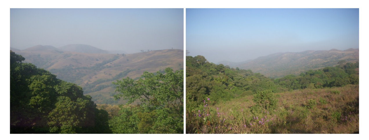
Plate 1: Photograph showing a section of Ngel Nyaki Forest Reserve

Furthermore, some of them are listed in the IUCN Red Data – Entandrophragma angolense, Lovoa trichiloiodes, Millettia conraui and Pouteria altissima – some others are new additions to the West Africa Flora – Pterygota mildbraedii, Anthonotha noldeae and Apodytes dimidiata . Furthermore, plants such as Isolona cf deightonii and Ficus chlamydocarpa are new to Nigerian flora. Till date, there are still many plants in the forest that are yet to be identified, and they are suspected to be new plants (Chapman and Chapman, 2001).