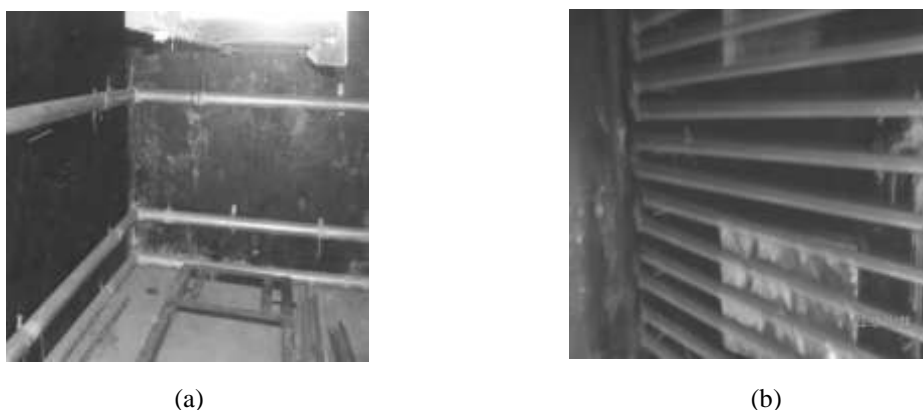
Figure 2.1: Arrangement of the hot air pipe in the kiln chamber: (a) Previous study; (b) Present study

Sawdust operated burner was tested for investigating its maximum efficiency for sawdust particle size and feeding rate (a mass of sawdust per minute). Using a mesh which has a pore diameter of 1 mm, sawdust was separated into two parts. Those two sawdust types were burnt one at a time under a certain sawdust feeding rate. Heat generated from burner by combusting sawdust was directed to heat a beaker containing a known mass of water under a certain period of time. As water was heating its temperature was measured and recorded at regular intervals. Same procedure was followed in investigating effective sawdust feeding rate (a mass of sawdust per minute) for the burner. Exhaust pipe (which contains heated air) coming from the burner, has been arranged as a spiral in the kiln chamber close to the walls of the chamber in the earlier design (Senadheera, 2009). The material of the pipe was iron which has a thermal conductivity coefficient value of 80 \text{ W m}^{-1} \text{ }^{\circ}\text{C}^{-1} . In the present study that pipe was replaced by an aluminium pipe and it was arranged close to one wall of the chamber. Aluminium possesses relatively a higher coefficient of thermal conductivity, which is 250 \text{ W m}^{-1} \text{ }^{\circ}\text{C}^{-1} .