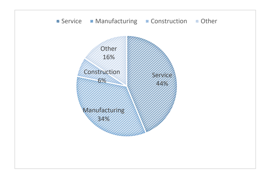
Figure 2: Distribution of papers based on industry