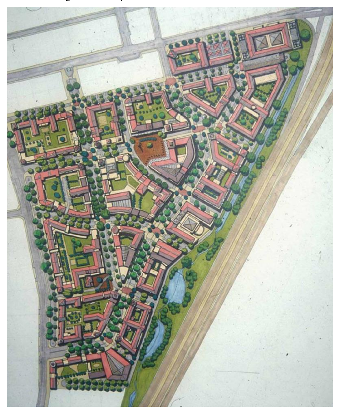
Figure 4. Melrose Arch Masterplan. Street system (connecting to primary local road network) and major public squares that both provide focus for retail, commercial and entertainment facilities as the catalyst for public life in the precinct (US and MAPPS).

be appointed, where 'business-as-usual' would tend to see larger corporate architectural practices dominating the commissioning processes.