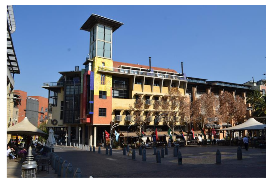
Figure 6. Melrose Arch. The main high street leads into one of the main squares with its place significance marked at the corner by the significant architectural feature of a mosaic tower. The pavement edges are activated by restaurant and cafe functions.

The concepts of continuity and legibility of building form are stressed through detailed building design codes that articulate how 'certain facades have an important topological role to play' (US and MAPPS). While all buildings are required to conform to the principles of the perimeter block that dictates a continuous streetscape to define the edges of the public domain, special architectural features were encouraged at strategic locations (Figure 6) within the precinct, while the other 'background' buildings require more modest treatment.