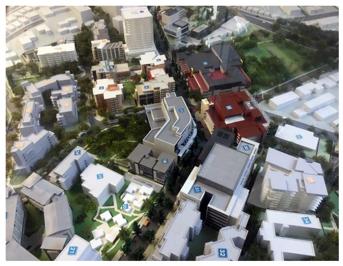
Figure 2. KGUV Precinct Model. The main high street is through the centre of the picture flanked by major educational, office and retail buildings. Residential buildings are predominantly at the precinct edges.

A Local Area Plan for the KGUV was developed for incorporation into the City Plan of the BCC, and is a performance based statutory control with principles for acceptable solutions for development of practical and affordable sustainable building outcomes within the village. All developments are required to submit a strategy that addresses compliance with sustainable principles for: energy efficiency, greenhouse gas reduction, water efficiency, waste recycling, and life cycle of materials. The incentive for individual developments which include sustainable measures is an entitlement to a 10% bonus of gross floor area (Woods and Hammonds, 2002) within a general range of 4 to 7 storey developments (BCC, 2000).