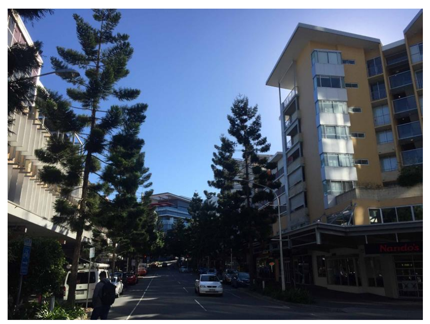
Figure 4. View along KGUV main high street.

• Permeability: spatially, through mixed land uses; socially, through attention to locations heritage including indigenous values; economically, through public and private land ownership delivering a spectrum of housing affordability models; environmentally, through attention to architectural scale and sustainable design.