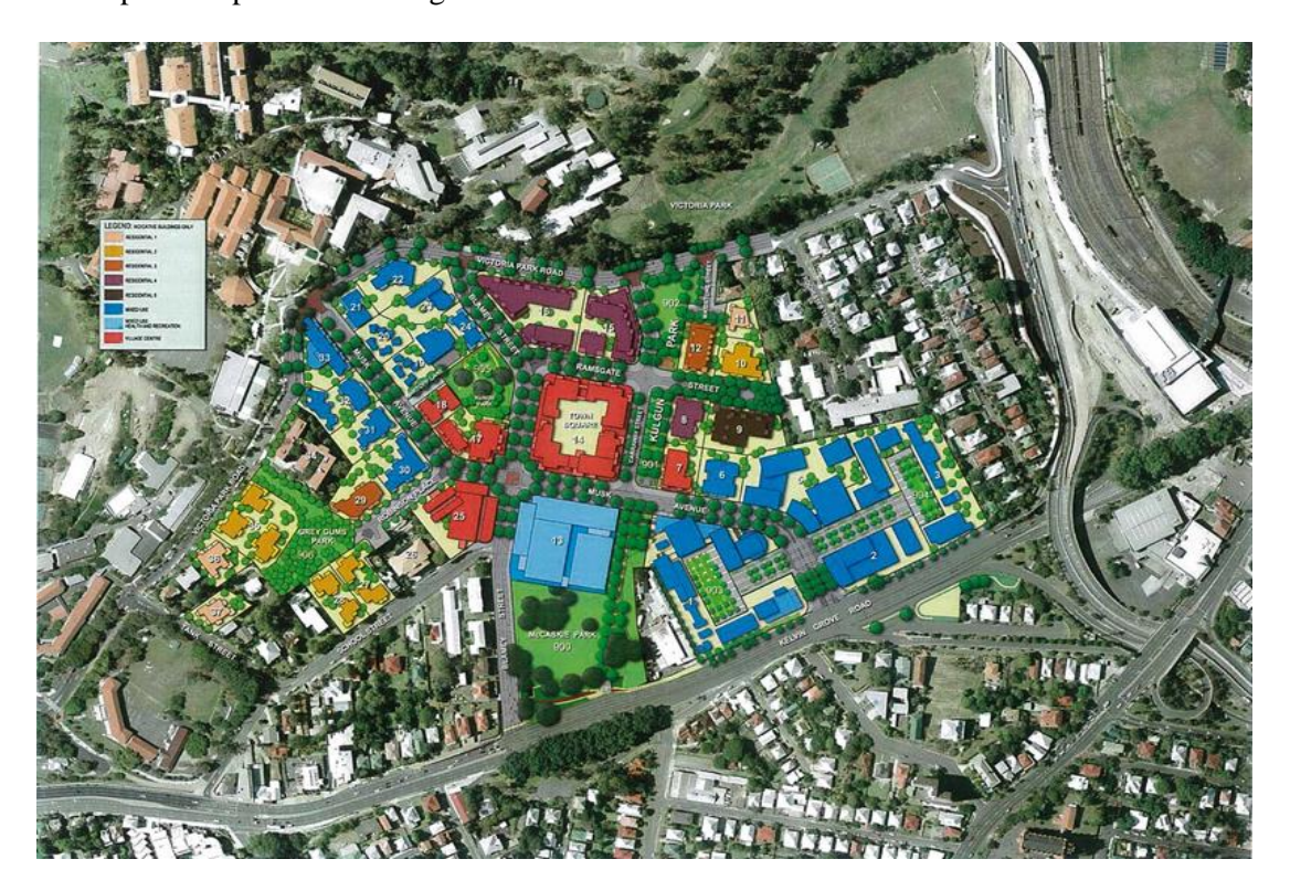
Figure 1. KGUV Original Land Use Plan 2001 (QUT, 2004). A town square is indicated in the courtyard space of the central perimeter block building, this was later changed to a semi-private space for the residential buildings, with the focus shifting to the adjacent main street intersection.

masterplan (see Figure 1) also sought to incorporate the best planning theories of Transport Orientated Development and Crime Prevention Through Environmental Design (Woods and Hammonds, 2002). Effective transportation is an important factor in the success of KGUV, with thoughtful integration of car, bicycle and pedestrian requirements. An open space system enhances the street network and connects the precinct with neighbouring parks, conserving the natural and cultural values of the site (QUT, 2002).