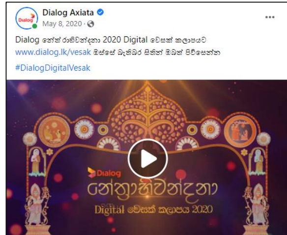
Figure 3: Dialog Axiata digital Vesak Poya day celebration 2020

Above mentioned figures were selected from a leading telecommunication company of Sri Lanka, named Dialog Axiata. They signify the digitalization of the Sri Lankan most important religious festival, the Vesak day celebration. Olcott made the Vesak day celebration a vital cultural event in Sri Lanka as he persuaded the government to declare it as a public holiday. He encouraged Buddhists to celebrate it with songs modelled on Christmas carols. He further developed the custom of sending Vesak cards on the analogy of Christmas cards. Although in the 4IR period, many customs and practices of the Vesak celebrations were evolved with the influence of digitalization. People send their Vesak wishes via digital platforms. Social media performs one of the key roles during this occasion as it connects the people of the world through digital devices such as computers and mobile phones. Not only the lay community, but monks also utilize these devices in their Dhamma sermons and practices. During Covid