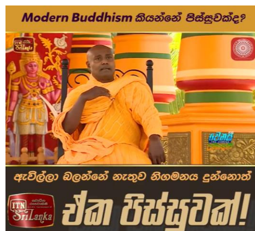
Figure 1: Facebook post titled 'is modern Buddhism weird?'

Today we experience the modernization of Buddhist discourse via various digital platforms. Some of them are completely different from the Buddha's statements. Contemplating Facebook we acquired a few cases and the following case is an example that reflects the nature of modern popular Buddhism.