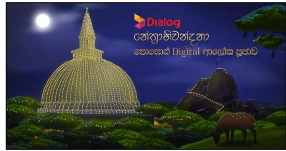
Figure 2: Dialog Axiata digital Poson Aloka Pooja Experience 2019

Comments are one of the valuable sets of data that help to categorize the features of the thesis, antithesis, and synthesis nature of particular behaviour of modern Buddhism in digital stages. While some comments agree with the respective opinion, some express opposing views, and some identify how the existing system should be improved. Sorting the comments will open a novel door to the study and they will lead to identifying the dialectic nature of modern popular Buddhism in digital media. Considering the ratio of the particular divisions, we can argue that the engagement of the respective audience accepts or rejects the existing system.