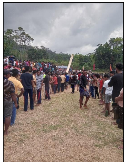
Figure 05. Team tug on the rope.

Participants noted differences across different regions' Ankeliya practices. Notable regional differences in rituals and cultural practices highlight the dynamic nature of cultural traditions, which frequently take on distinctive qualities in various locations, adding to the richness and diversity that are inherent in cultural legacy.