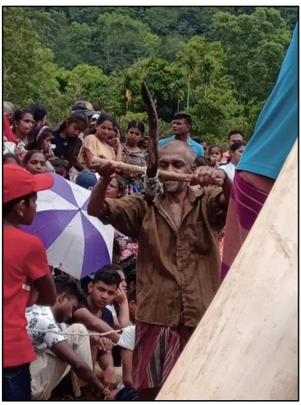
Figure 04. Ankeliya horn.