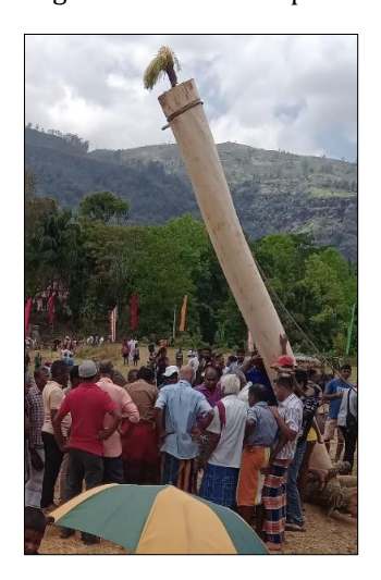
Figure 01. Ang-gaha in the Ang-pitiya.