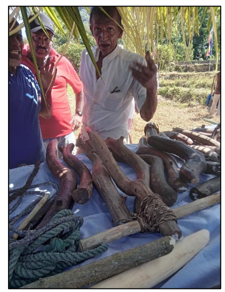
Figure 03. Udupila Altar ( Angmassa ) (Photography by the author).

According to the participants, this game was held for seven days or multiple of seven in the past, but now it is often limited to one day. Ang vadamavima is a ceremonial parade that takes place at the start of the ritual in Madakumbura village. In this ceremonial parade, necessary equipment ( Ang-abarana ) for the game will be brought and all this equipment stored on a two side altar ( Ang-massa ) in a ritual-performing open area.