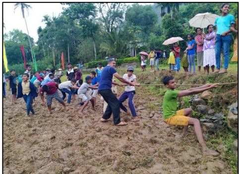
Figure 06. Team members tugging rope (Photography by the author).