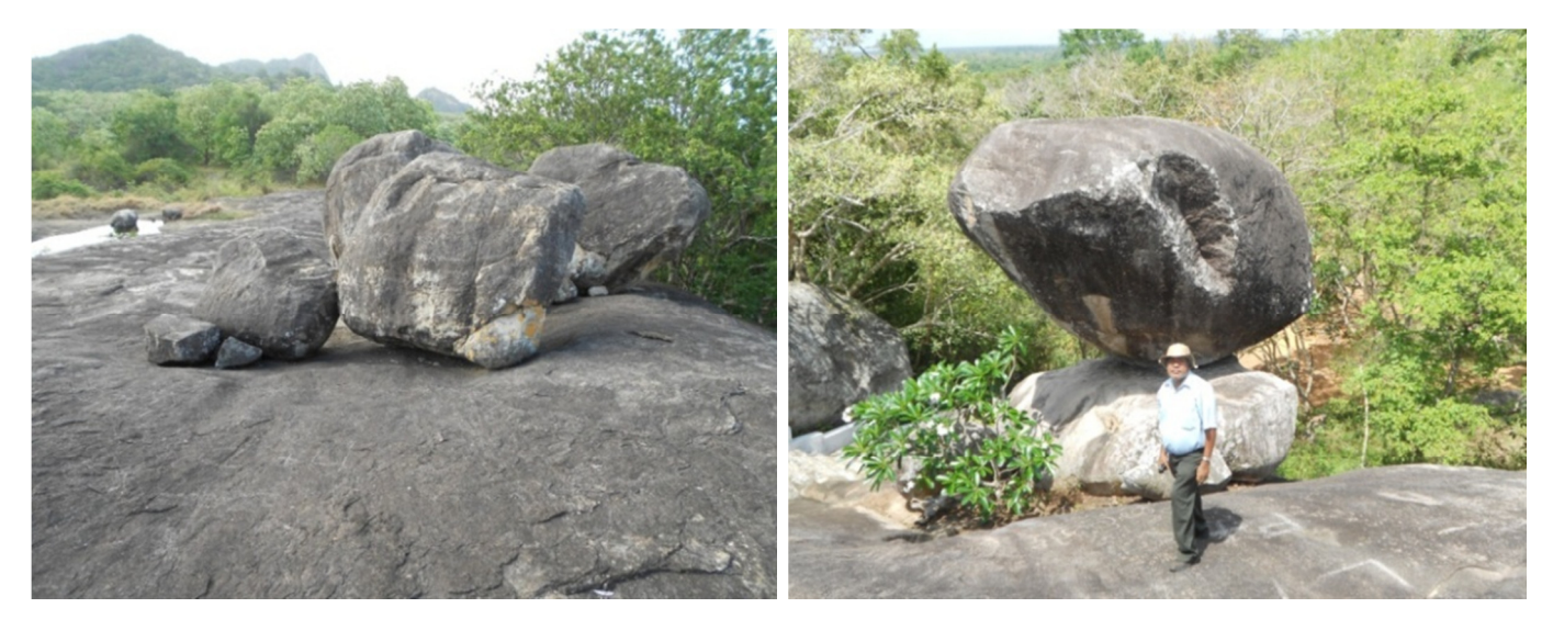
Figure 3: Erratic boulders at Viharagala Temple site (coordinates 7°46'N, 80°28'E).

areas and ferruginized, indurated gravel bearing deposits exposed at Erunwela, Muttibendivila, Pallama, Metiyagane and (in the subsurface of hummocks throughout the lower plains in the northwest (Wayland 1919, Coates 1935, Deraniyagala 1958, Cooray 1963 and 1984). The original transported materials were converted to iron-rich brown and reddish brown earth embedded with well rounded quartz gravel to pebble size are found in a hummocky area at Leekolawewa in the Kurunegala District (Photograph 5). The sizes of the well rounded and oval shaped pebbles and cobbles vary from 2.0 cm to 8.0-10 cm. This author believes that these sediments represent weather-worn outwash plain deposits produced at several stages during the glacial history.