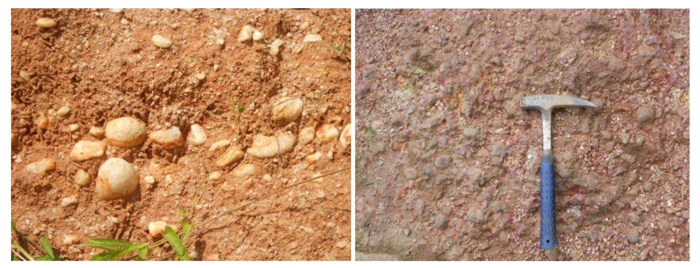
Figure 5: A gravel hummock at Leekolawewa (coordinates 7°42'N, 80°02'E), about 40m above MSL, in Northwestern Province.