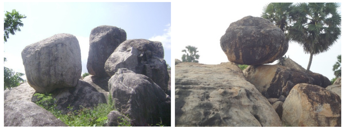
Figure 1: Showing erratic boulders at Tennamavadi (coordinates 8°58'N, 80°58'E), about 1.5 km southwest of Kokkilai Lagoon mouth, 15 -20m above MSL in Northeast coast.

ice-rafting. Ice-rafted debris or ice-rafted deposits and stream feddeposits were deposited onto the bottom of the water body, for example, onto a river bed or an ocean floor. Erratic boulders at Tennamavadi are located at coordinates 8°58"N and 80°58'E in Sri Lanka's Northeastern Coastal Zone very close to the present coast. The locality is about15-20m above MSL and 1.5 km southwest of Kokkilai Lagoon mouth, (Figure 1). Colour and mineral composition indicate that the rocks are derived from the Highland Complex rocks. They are mainly quartzite, marbles, garnet-sillimanite-schist and chanockitic gneisses. The erratic boulders at Valaichchenai Lagoon (coordinates 7°56'N, 81°33'E), and Uraniya (Pottuvil) Lagoon (coordinates 6°53'N, 81°50'E) are about 2.0m - 4.0m above MSL (Figure2). The lithology of these boulders being composed of a heterogeneous group of gneisses, migmatites and granites with scattered sedimentary bands confirm the source to be Highland Complex rocks (Cooray 1984). The erratics exhibit rounded, oval and elongated shapes ranging in from pebbles to large boulders hundreds to thousands of metric tons in weight. These appear to have been dropped on rock outcrops or on the ground by melting glaciers moving in a northeasterly direction.