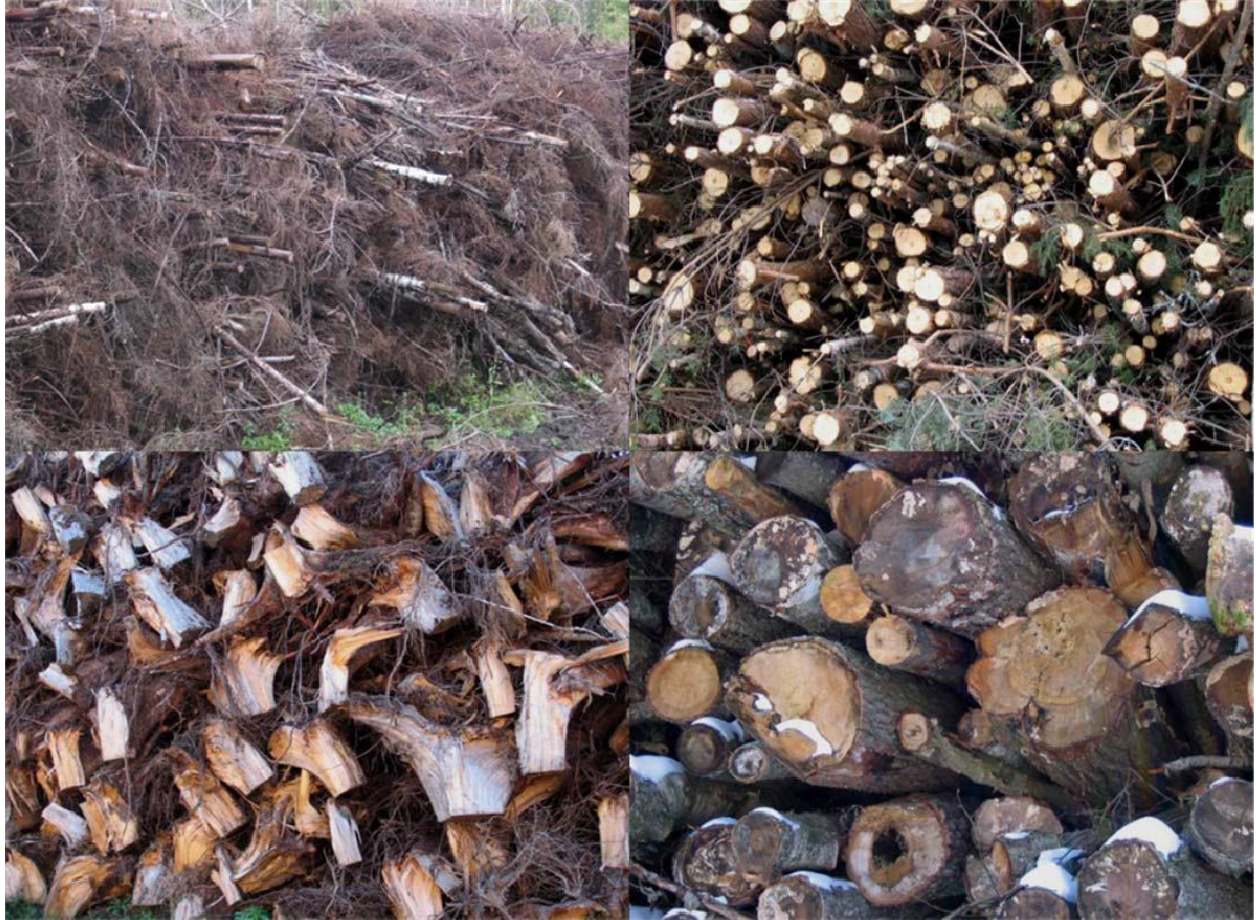
Figure 2: Primary biomass sources from forests.

thinning in young plantations. Since forest plantations in Sri Lanka produce comparatively small quantity of industrial wood, less than 10% of the national wood demand, the amount of logging residues generate through logging operations is also very small. As such Sri Lanka does not have a viable forest based supply chain to provide biomass for commercial power generation.