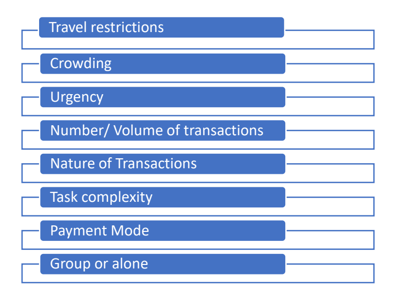
Figure 1: Situational factors affect the use of SSTs

A summary of the situational factors that affect the use of SSTs is provided in figure 1.