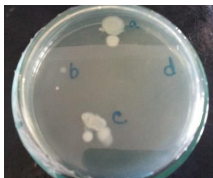
Figure 2. Thumbprints of differently treated thumbs.

Effectiveness of the antibacterial adhatoda soap was further tested using the thumb impression test explained in the methodology section. During this experiment, one hand was washed with the test soap and the other one was washed with the control soap and thumbprints of both hands were made on a sterile agar plate to monitor the microbial growth on the area of the thumbprints. The results of the experiment are shown in Figure 2.