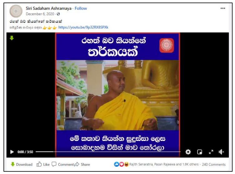
Figure 2 : Selected post from the Siri Sadaham Ashramaya Facebook page (Siri Sadaham Ashramaya 2020).

Based on the above mentioned post, comments (reply comments were