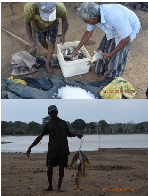
Figure 3. A & his helpers collect and prepare their weekly fish harvest to the market.

Second case study: A2 is the third son of A. He is not happy with traditional cattle farming and fishing, because he cannot earn as much money as he wishes. According to him,