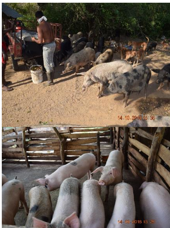
Figure 4. A2's pig farm within the forest close to Kadawara tank

Concepts of sin , merit and soul are norms of traditional (feudal) socioeconomic superstructure, yet when changes occur in the superstructure and cultural hegemony, such concepts are no longer in force (Salamini 2014). But the issue is that when forest utilization practices change from cattle farming to pig and poultry farming, its environmental impact change negatively. A2's herds of pigs are let loose into the forest to scavenge food from 8.30 in the morning to 6.00 p.m. thus these pigs eat whatever they can eat on their way in the forest biosystems. Compared with the effects of cattle framing on ecosystem, this is more harmful to the diversity of wild animal species such as reptile and amphibian species.