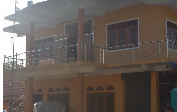
Figure 6. B's Luxurious house in the research site

When capitalist dreams of B or the villagers who follow B 's path are analysed, it can be identified how ridiculous are the norms/values in a capitalist superstructure in the world southern peripheral context of on which capitalism has been superimposed (De Silva, 2012; Gunasinghe, 1990; Jayawardana, 2000; Kumara, 2016; Ulyanovsky, 1981).