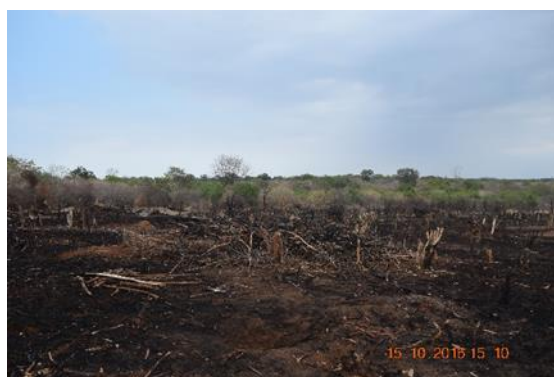
Figure 5. Setting fire to forestland for Chena cultivation

Most importantly, such illegal forest utilization practices occurred in 'profit ordained' superimposed capitalist social system is more harmful to the natural environment compared with forest utilization practices in a traditional feudal social system (Biel, 2015; Kumara, 2016).