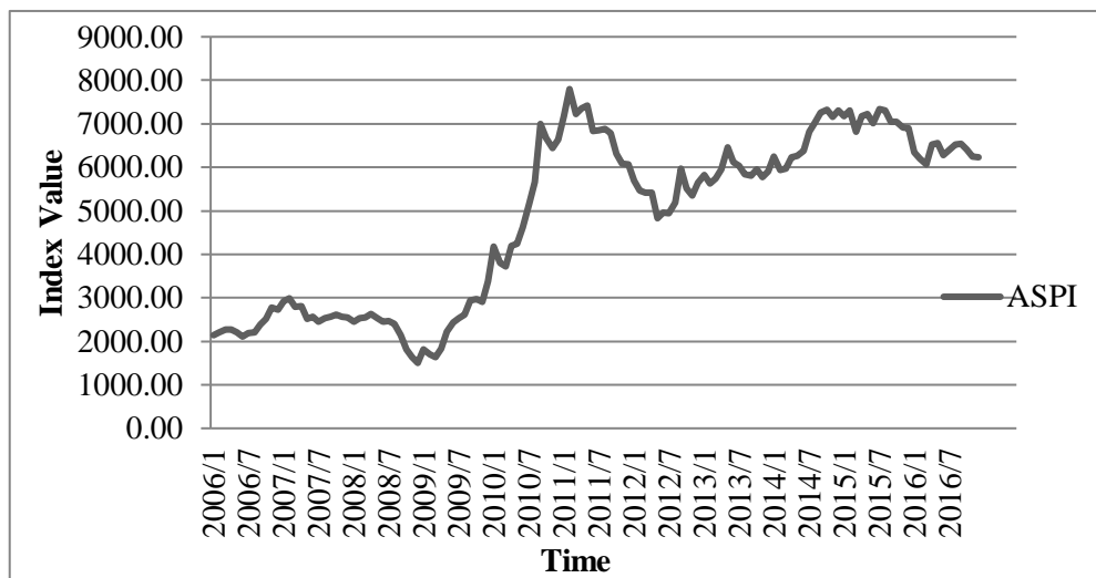
Figure 1: All Share Price Index, CSE