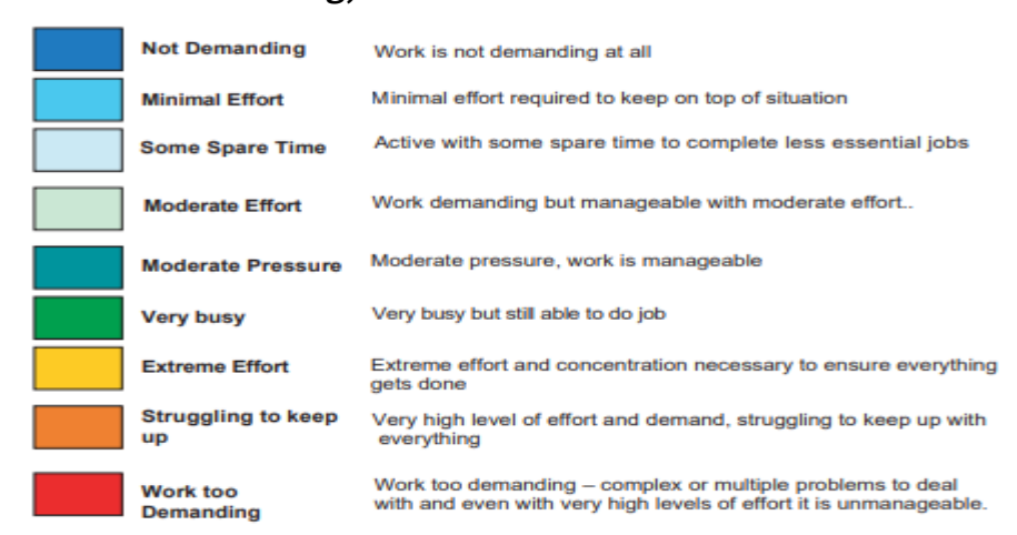
Figure 2. IWS for Rail Signalers (color codes run from blue for not demanding to red for work is too demanding)

Respondents rate the individual items of the IWS according to the amount of workload each item conveyed, on a scale ranging from 'work is not demanding at all' to 'work is too demanding' (Kramer, Johnson, and Zeilstra, 2017).