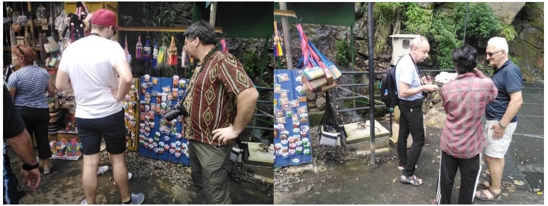
Figure 1. Peddlers Engage in Mobile Selling at Rawana Ella

Tourist arrivals to this region generate a huge demand for local transport services and food. Therefore, the businesses which provide transport facilities and food, tiffin, snacks, fruits and other related services and facilities are a noticeable feature of the informal sector. Accordingly, there are 12 persons who provide food and associated services while 11 persons provide transport services. The demand related to the transport service is due to many reasons. The study area is located at a proximity to the most popular train route of Sri Lanka. Tourists use Colombo-Badulla trains up to Demodara railway station where the world famous Nine Arch Bridge and the railway loop are located and travel to the different tourist sites using the transport facilities provided by the local, small scale transport providers. On the other hand, the public transport system of the area too is not at a satisfactory level. Since most of the tourist sites have been scattered all over the region, it is a difficult task to travel by public transport. This background ultimately increases the demand for privately owned transport services which are mostly operated by local residents.